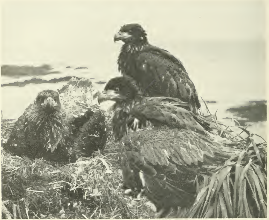
FIGURE 7.—Young bald eagles in their nest on offshore pinnacle, Rat Island, Aleutian Islands, Alaska.

pair of eagles on the ground in Crawford County, Mich. Here the birds had constructed their nest on a knoll in the burned-over plain of a pine forest (Sharritt 1939).