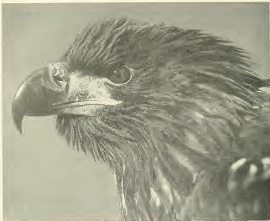
FIGURE 5.—A nearly fledged young bald eagle, Atka Island, Aleutian Islands, Alaska. The dark plumage of the head, the dark bill, and the dark iris of the eye are in marked contrast with the coloration of the adult bird with its white head and light-yellow bill and iris.

bald eagles including adults and juveniles of both sexes. These data appear in table 1.