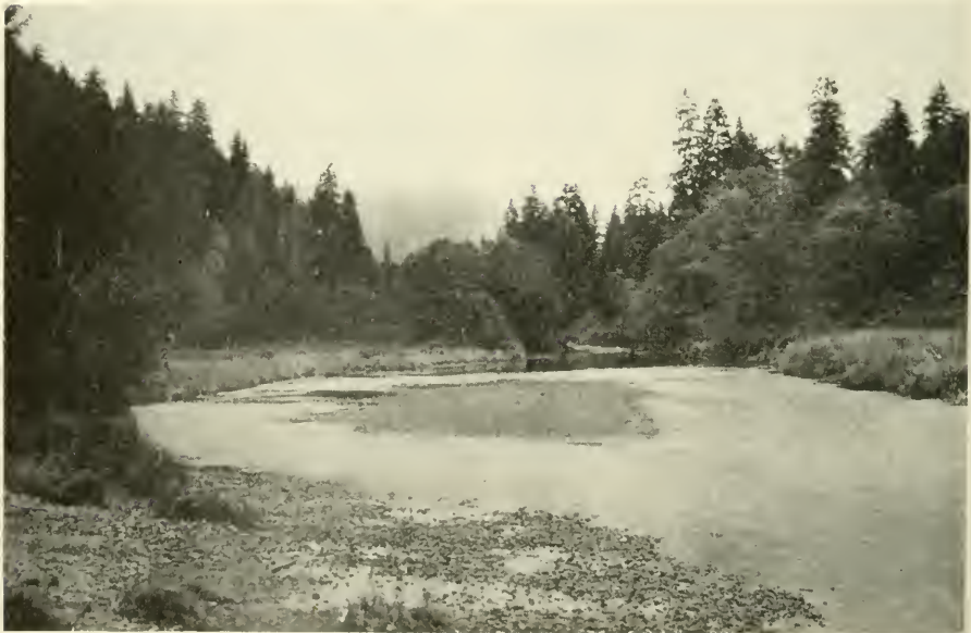
FIGURE 2.—Typical bald-eagle habitat, mouth of Rodman Creek, Baranof Island, Alaska. Nineteen bald eagles were in sight at this point at one time on August 9, 1941.

In the course of field studies conducted in Southeastern Alaska