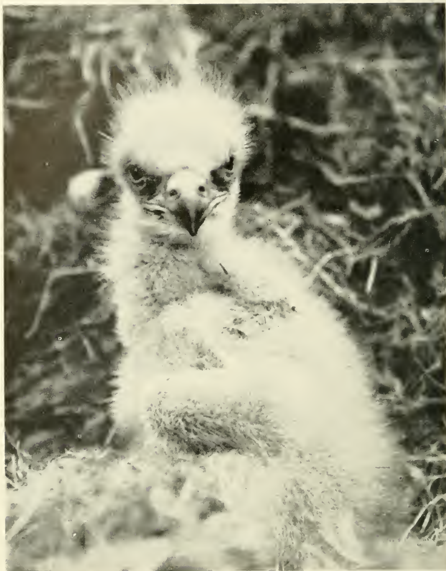
FIGURE 3.—Downy young of the northern bald eagle on Ananiuliak Island in the Aleutian Islands, Alaska.

females. Of 133 adults, 64 were males and 69 females.