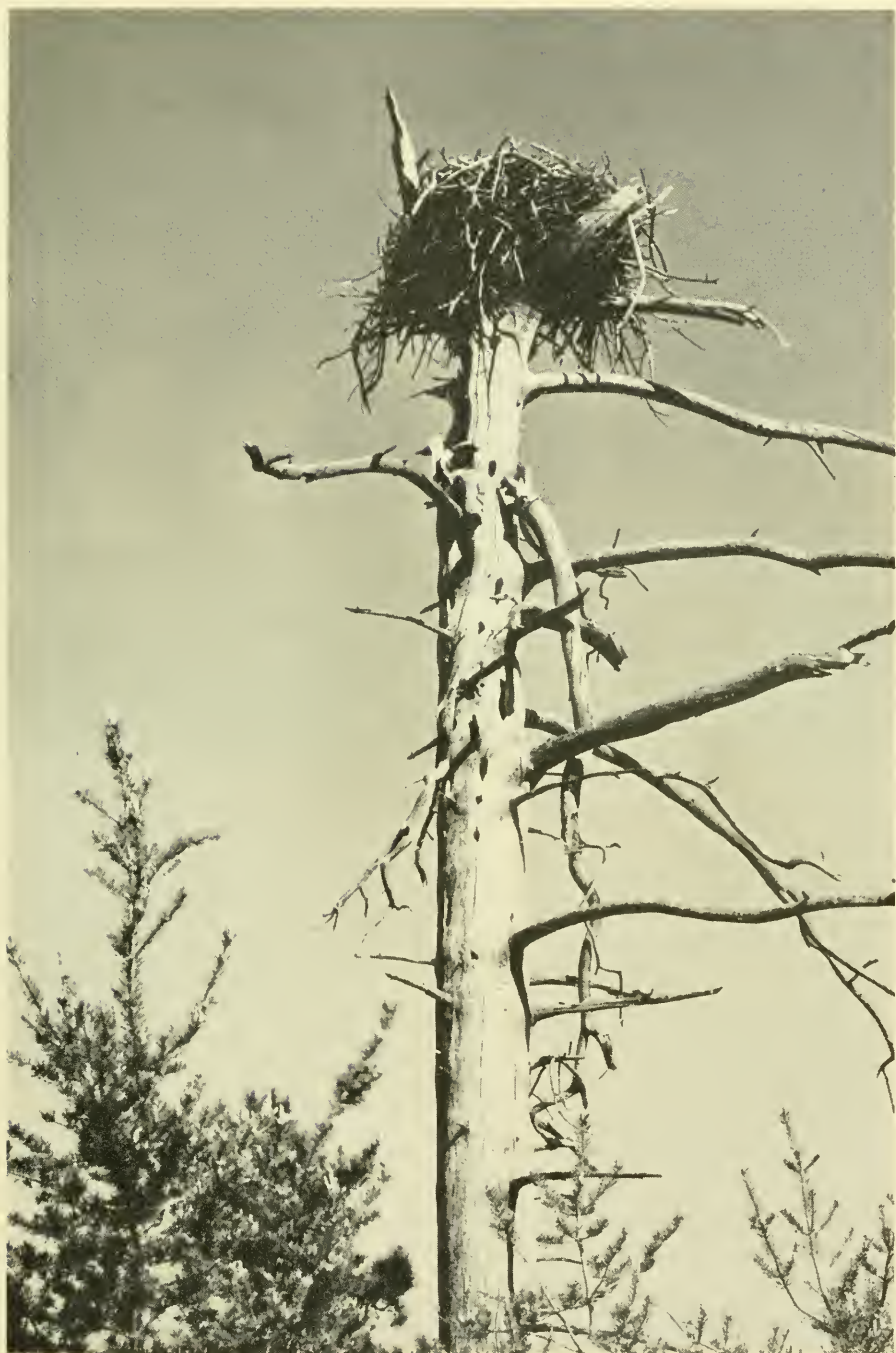
FIGURE 6.—A typical nest of the bald eagle, Seney National Wildlife Refuge, Mich. Located in a dead red pine, 40 feet from the ground, it was used for several years in the late 1940's. A Canada goose used its platform as a nest site in 1950.