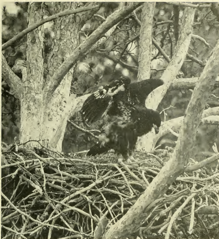
FIGURE 4.—A nearly fledged young bald eagle, Seney National Wildlife Refuge, Mich. Flexing its wings, it is almost ready to take its first short flight. The characteristic flat-topped nest of sticks is lined with finer material and is located 65 feet from the ground in a red pine.

As in most birds of prey, the female bald eagle is larger and heavier than the male. Friedmann (1950) stated that the average wing length of 16 adult male bald eagles from Southern United States was 529.2 millimeters (20.83 inches) and that of 29 adult male northern bald eagles, 588.6 mm. (23.18 in.). Comparable measurements for the wings