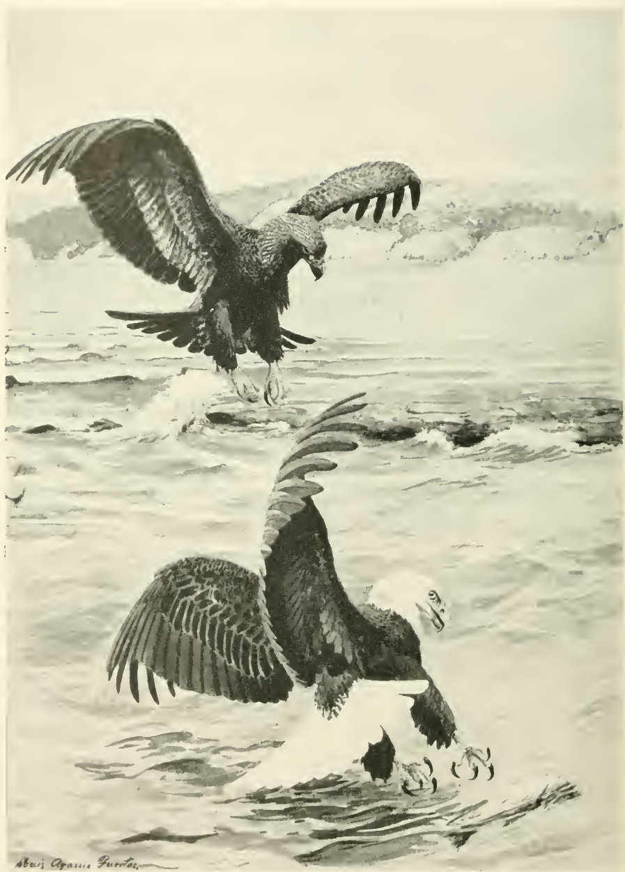
The bald eagle; juvenile above and adult below. (From a Fish and Wildlife Service painting in color by Louis Agassiz Fuertes.)