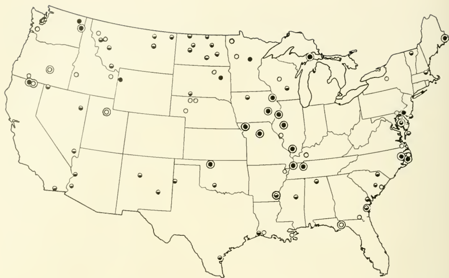
FIGURE 1.—Bald-eagle abundance on 89 national wildlife refuges in the fall, winter, and spring of 1953-54 compared with that of former years. The solid black dots indicate an increase from estimates made in the 1940's; the half-black dots, no change; and the circles, a decrease. An outer circle indicates 10 or more eagles reported. The greatest number was on the Upper Mississippi River Wild Life and Fish Refuge, an extensive area reaching into the States of Minnesota, Wisconsin, Illinois, and Iowa, where 300 bald eagles were reported in the winter of 1953-54.