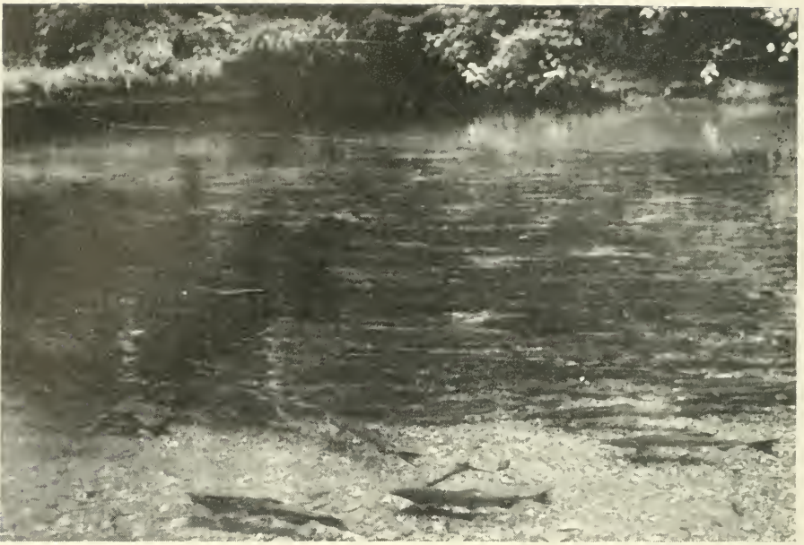
FIGURE 8.—Pink salmon in Rodman Creek, Baranof Island, Alaska, on August 10, 1941. Observations revealed that bald eagles were feeding on salmon which was largely, if not entirely, carrion.

say regarding the relation of the bald eagle to salmon.