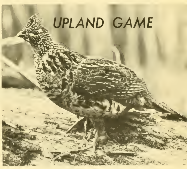
U.S. Soil Conservation Service

A sora rail bursting from a Carolina marsh, a snipe careening from an Oregon meadow, a woodcock exploding from a Connecticut thicket are all products of many widely scattered wetland types.