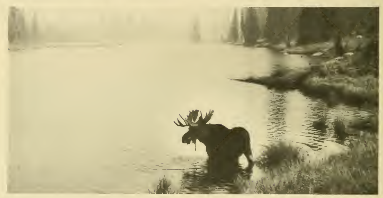
U.S. Forest Service

In only a few places is the moose now abundant enough for hunting. He is even more important as a symbol of remote wilderness. In fly season and when the lily roots are their richest, this valued animal is a wetland dweller.