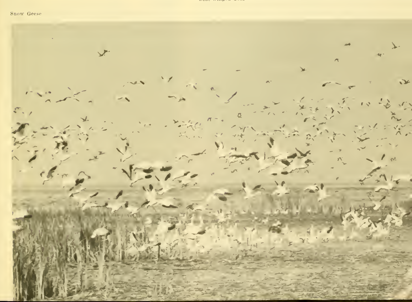
Massachusetts Audubon Society