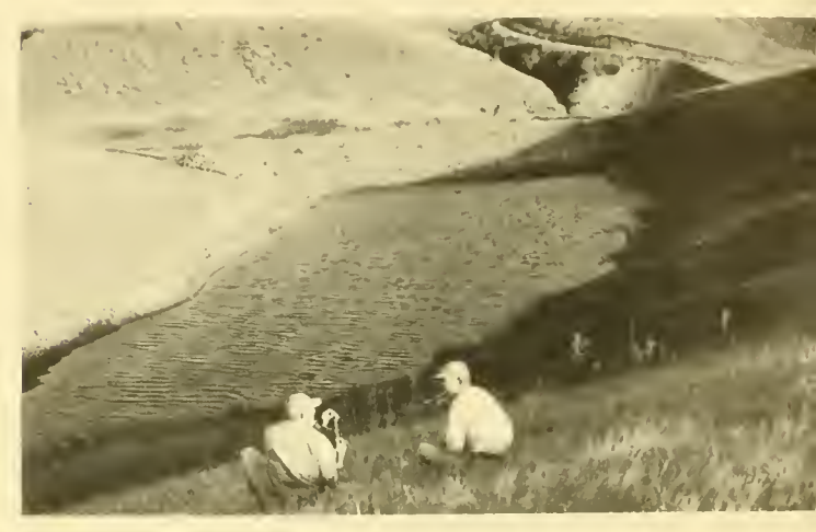
U.S. Soil Conservation Service