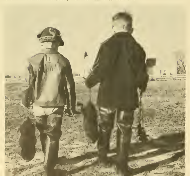
North Carolina Wildlife Resources Commission