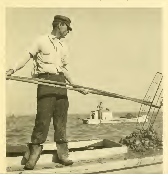
Alabama Department of Conservation

The oysters produced in salt marshes and shallow bays are an important source of food and income. Many marine fishes, such as menhaden and shrimp, depend on wetlands as nursery areas. These important species spend crucial parts of their life cycles in tidal estuaries and marshes.