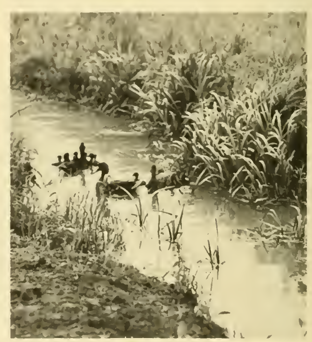
U.S. Soil Conservation Service

Other duck breeding grounds throughout the United States are widespread and varied. Individually, few are impressive. Together, they raise the flights of waterfowl that give the autumn marsh life—and value.