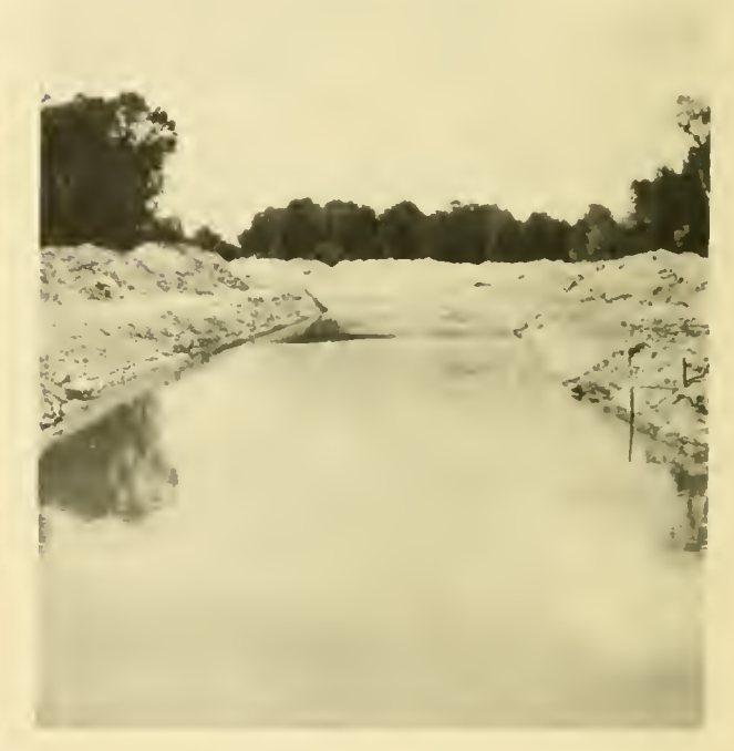
Louisiana Wild Life and Fisheries Commission