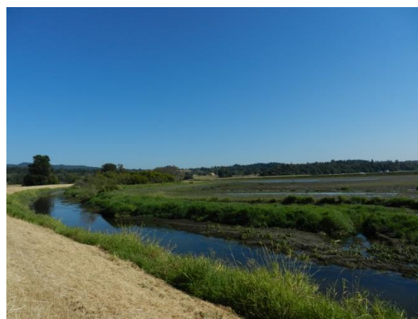
Fisher Slough Levee Removal Project Site

The workshop was divided into several components. Prior to the workshop, the Restoration Center in the Northwest Region led a field trip to several sites in western Washington that have been undergoing habitat restoration to improve habitat function and ecosystem services.