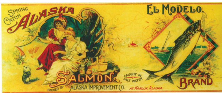
El Modelo Brand salmon can label, spring catch Alaska salmon, packed by Alaska Improvement Co., Karluk, Alaska. (Lantern Press, Seattle, WA)