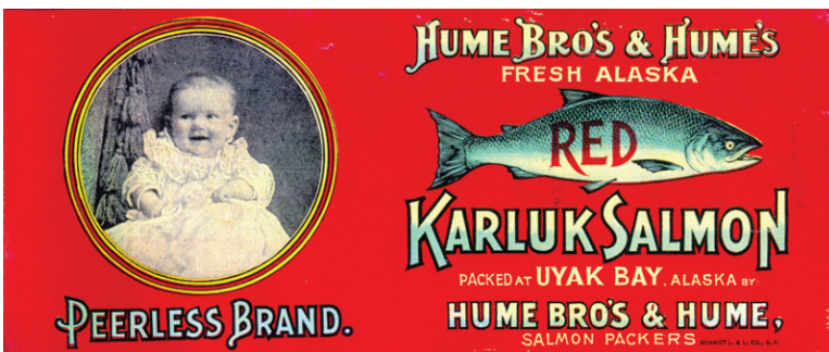
Peerless Brand salmon can label, Karluk red salmon, packed by Hume Brothers and Hume, Uyak Bay, Alaska.