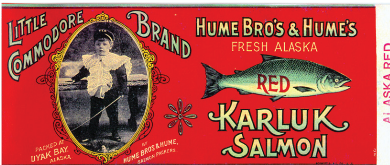
Little Commodore Brand salmon can label, Karluk red salmon, packed by Hume Brothers and Hume, Uyak Bay, Alaska.