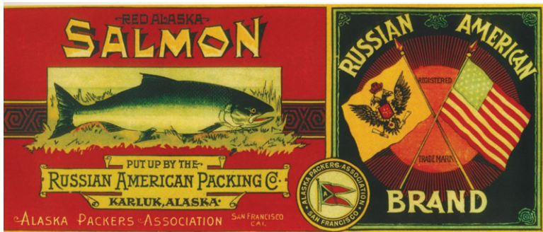
Russian American Brand salmon can label, Alaska red salmon, put up by the Russian American Packing Co., Karluk, Alaska Packers Association, San Francisco.