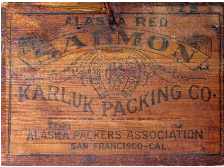
Karluk Packing Co. sockeye salmon crate, Horse Shoe Brand, Alaska Packers Association, San Francisco.