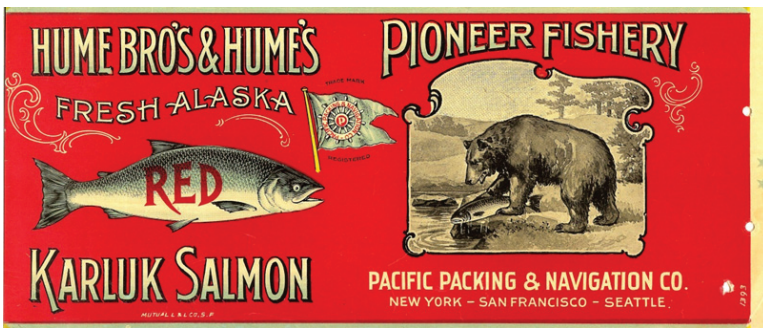
Pioneer Fishery salmon can label, Karluk red salmon, Hume Bro's & Hume's, Pacific Packing & Navigation Co., New York, San Francisco, Seattle.