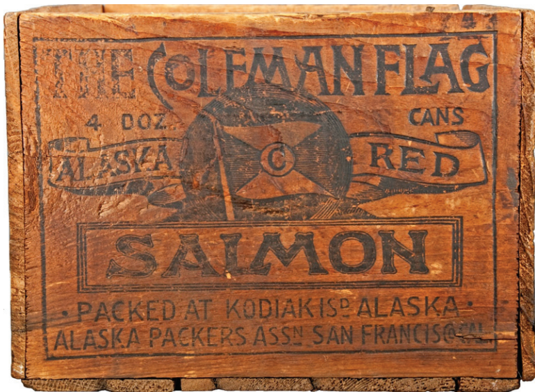
Coleman Flag Brand salmon crate, Alaska red salmon, packed at Kodiak Island, Alaska, by Alaska Packers Association.