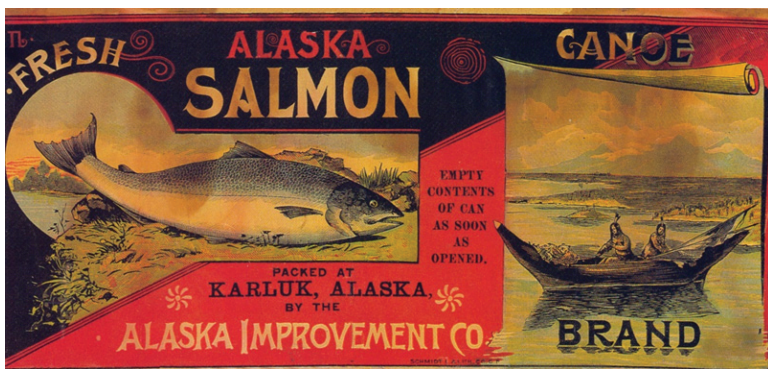
Canoe Brand salmon can label, packed by Alaska Improvement Co., Karluk, Alaska. (Ralph and Terry Kovel, The Label Made Me Buy It , Crown Publishers, NY, 1998)