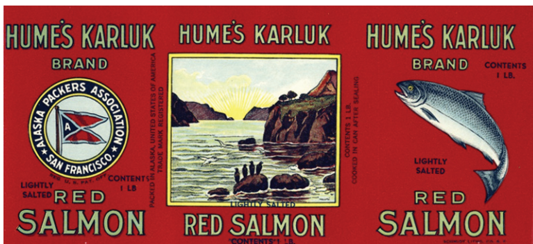
Hume's Karluk Brand salmon can label, red salmon, Alaska Packers Association, San Francisco.