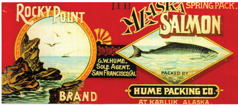
Rocky Point Brand salmon can label, spring pack Alaska salmon, packed by Hume Packing Co, at Karluk, Alaska.