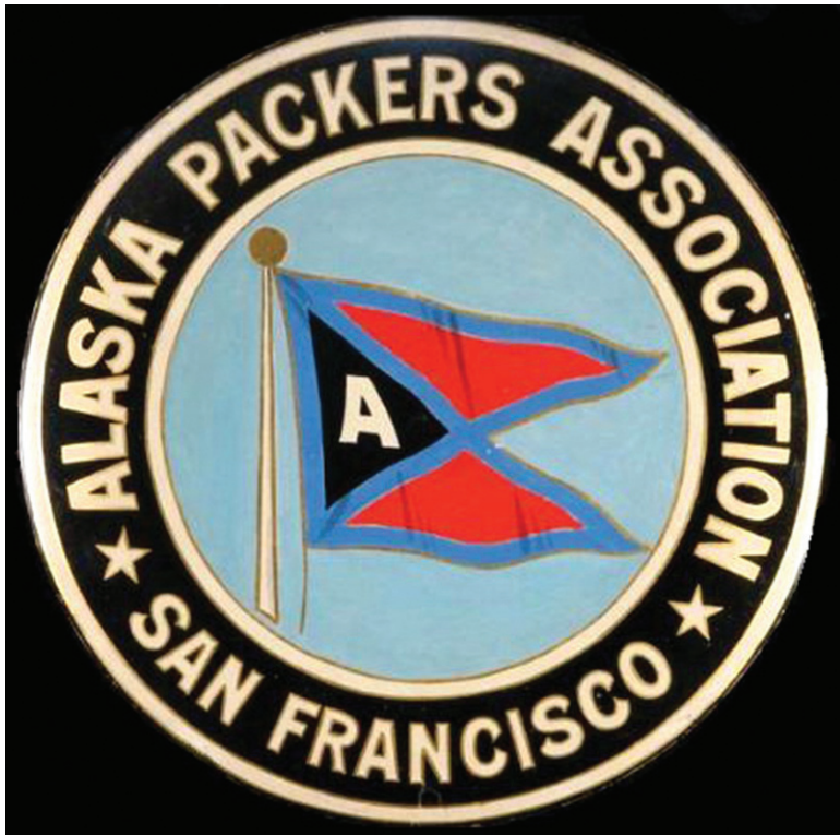
Alaska Packers Association headquarters plaque and logo, San Francisco.