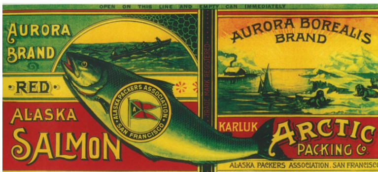
Aurora Borealis Brand salmon can label, Alaska red salmon, Arctic Packing Co., Karluk, Alaska Packers Association, San Francisco.