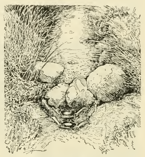
FIGURE 2.—Details of setting trap for bobcat in trail; trap bedded just beyond a natural obstruction in the path; the working parts of trap are lightly packed with cotton to insure springing when the ground is frozen

After the trap has been firmly bedded it is advisable to cover it with fine pulverized earth similar to that found in the mound of a pocket gopher. This will do for the spring of the trap. Dry and finely pulverized horse or cow manure may be more advantageously used to cover the inside of the trap jaws. Care should be taken to keep all loose dirt from getting under the pan and to see that there is an open space beneath it of at least a quarter of an inch.