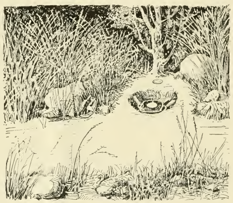
FIGURE 4.—Det ills of placing scent set on cleared space between the trail and a clump of higher weeds or grass used as a scent post. Between the trap set and the scent post may be buried a jar having perforated top and containing cotton saturated with oil of catnip; or other scent material may be sprinkled on the clump of weeds to lure the bobcat to the trap

Some Fish and Wildlife Service hunters employ this lure by burying at one side of a bobcat runway a small glass jar or bottle (fig. 4) into which has been