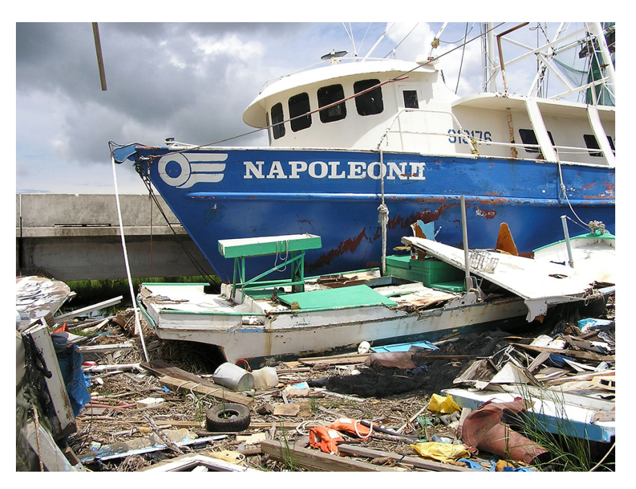
Figure 5.—Smashed commercial fishing boats pinned against the Empire, La., bridge, still unmoved Aug., 2006.

<sup>2</sup>Data source: Preliminary assessment of the impacts of Hurricane Katrina on Gulf of Mexico coastal fishing communites. DOC/NOAA/NMFS, Mar. 2007. http://sero.nmfs.noaa.gov/sf/socialsci/pdfs/FINAL-PUBLIC-N.pdf, accessed 8 Dec. 2013.