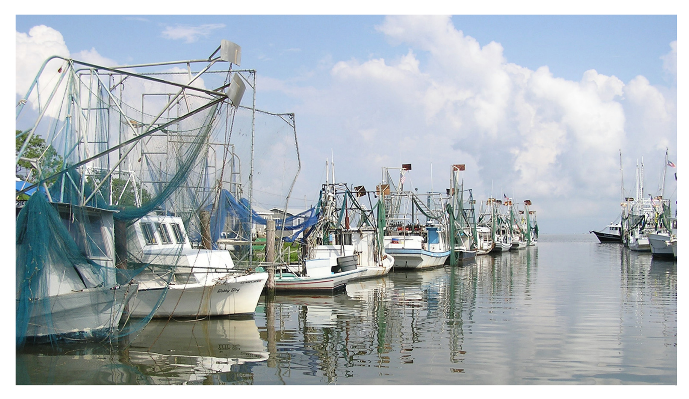
Figure 1.—Commercial shrimp vessels, Grand Isle, La., before Hurricane Katrina, July 2004.

duced trip limits, and closed seasons. The cumulative effects of these restrictions added hurdles for Gulf commercial fishermen. Individual fishermen's ability to switch from one fishery to another as an adaptation to changes in management regime was also becoming more difficult due to new regulations, though historically this had been a common coping strategy among commercial fishermen.