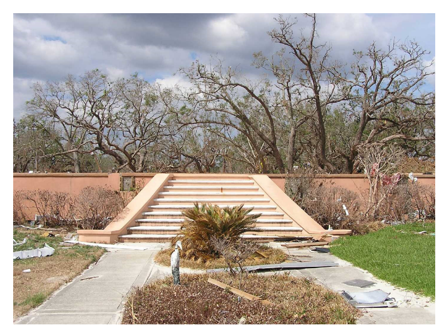
Figure 3.—Stairway to nothing is all that remains of a once substantial home in the Long Beach area of coastal Mississippi after Katrina, Oct. 2005.