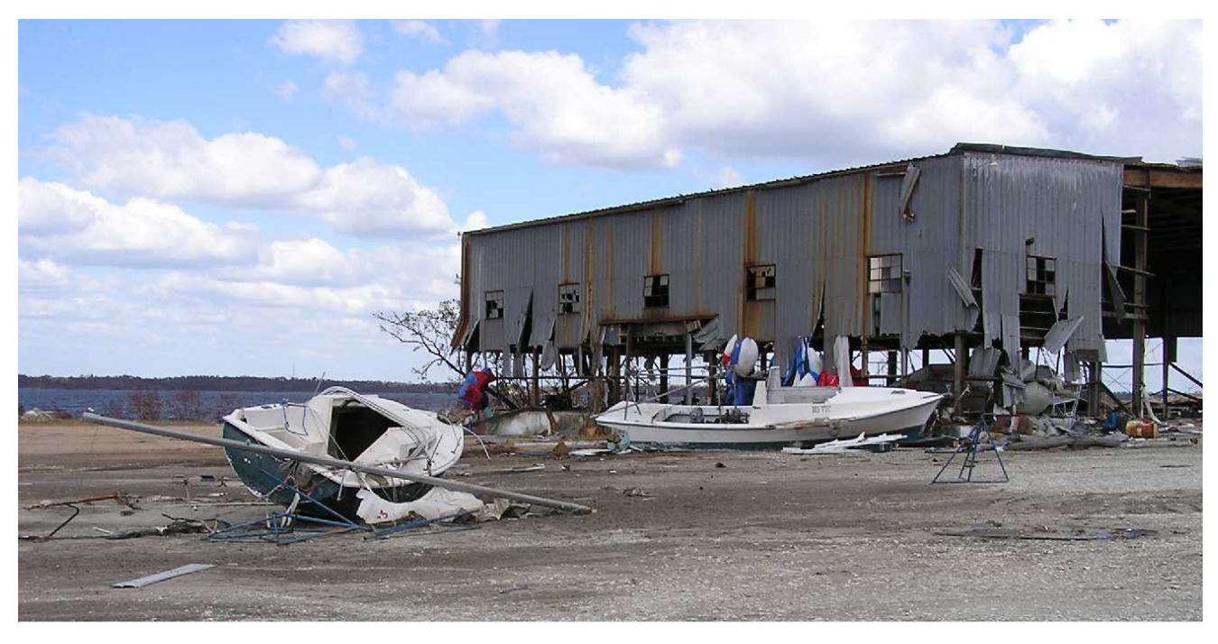
Figure 6.—Destroyed recreational boats and recreational boat storage facility, Biloxi, Miss., Oct., 2005.

el of 126 million lbs, while the value dropped from $376 million to $321 million. This reflected the shift of Louisiana catch to surviving Mississippi processors while Louisiana processors worked to restore their own processing capacity. For example, vessels from the Cameron, La., menhaden plant were assigned to the Moss Point, Miss., menhaden plant until the Cameron plant was reopened in mid-June 2006. The volume of fish processed in 2006 was 16% less than the 1998 figure of 154.7 million lbs, while the overall value of these products was 23% less in 2006 ($321 million) than it was in 1998 ($417 million).9