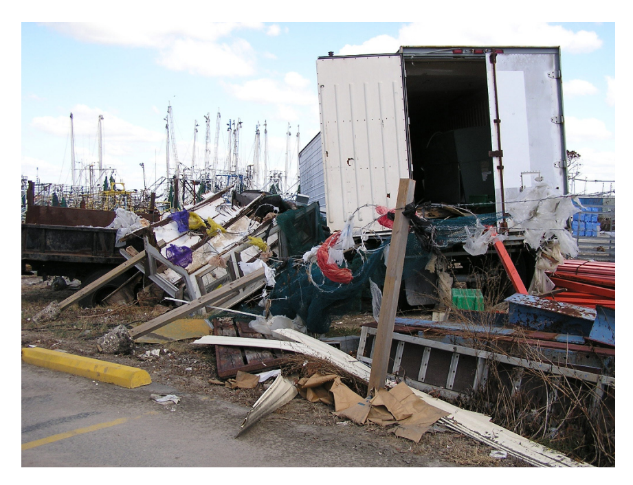
Figure 4.—Destroyed equipment, Back Bay area, Biloxi, Miss., Oct., 2005.

The next three sections present a detailed examination of Katrina's impact on fishing infrastructure in Louisiana, Mississippi, and Alabama.