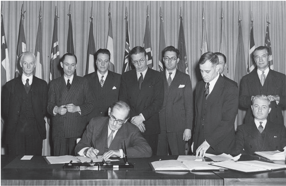
Figure 1.—Signing the International Convention for the Regulation of Whaling in Washington D.C., December 1946.

The huge Soviet whaling factory fleets that once plundered the world's oceans are now gone, and the U.S.S.R.'s illegal whaling lies in the past. But from this campaign—which went undetected, or at least unacknowledged, for three decades—important lessons can and should be learned with regard to the management of whaling today, and indeed of the exploitation of natural resources in general.