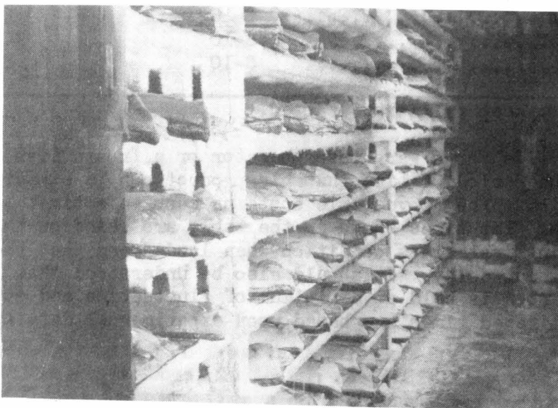
Fig. 1. Sharp freezing large fish. These unglazed fish are subject to dehydration.

Fish which are frozen in the round, or those which are too large to be wrapped in moisture-vapor-proof material, should be glazed with a heavy coating of ice to prevent freezer burn or dehydration. In order that the glaze can be maintained it is necessary to examine them in the storage room at frequent intervals to be sure that the glaze has not evaporated. Reglazing should be done as soon as the condition of the glaze indicates it is necessary. Water for this purpose should be as cold as possible without freezing in the sprayer, so that it will freeze almost instantly when sprayed on the cold fish. In many cases where large fish are frozen on expansion coil shelves in a sharp freezer they are left in the freezer longer than is necessary without the protection of the glaze. This practice often results in serious losses due to freezer burn and actual loss of weight due to dehydration. The correct practice in the case of large fish is to remove it from the sharp freezer and glaze promptly so as to reduce losses to a minimum.