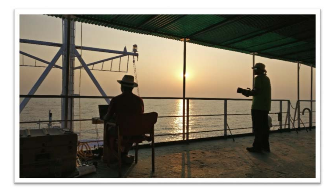
Figure 13. Observers on watch.