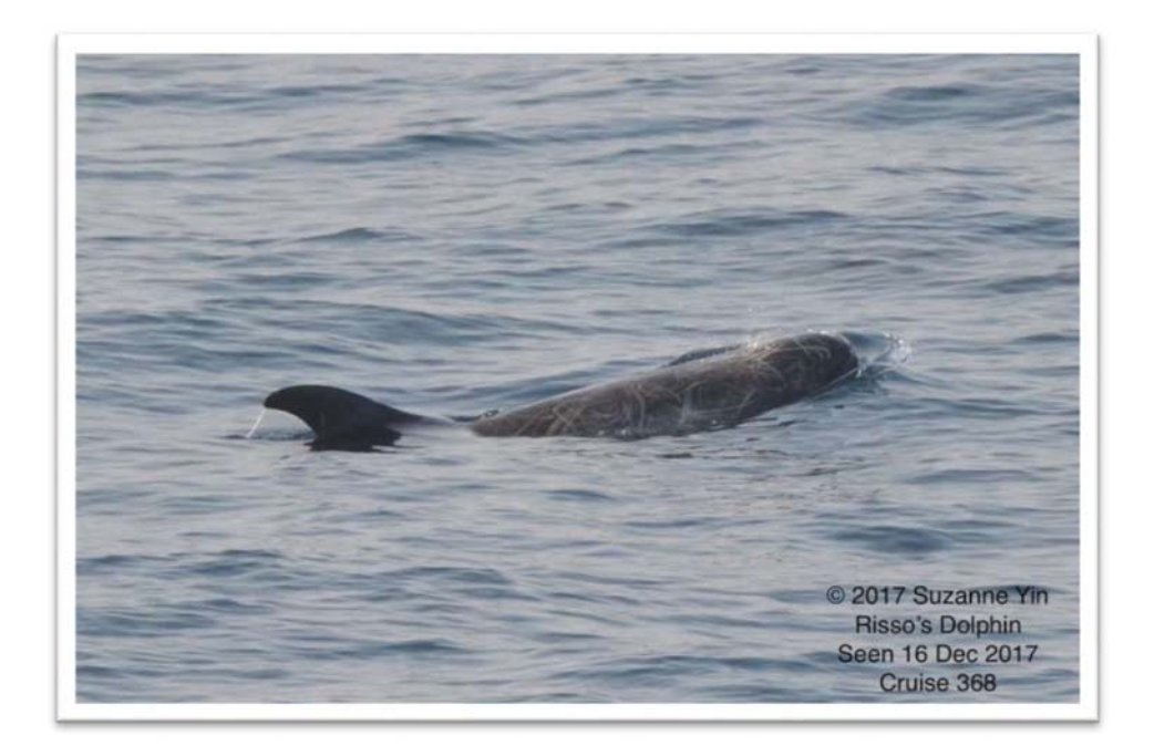
Figure 6. Risso's dolphin seen 16 December 2017.