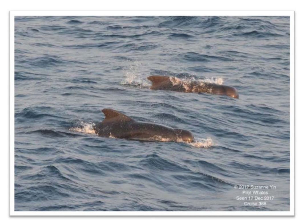
Figure 7. Pilot whales seen 17 December 2017.