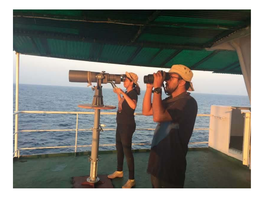
Figure 1. Observers using "Big Eye" binoculars (L) and handheld binoculars (R) to survey for cetaceans at sea (photo credit: Mridula Srinivasan).

Animal behavior and distance from ship, weather conditions, and ship speed were all factors considered before the ship broke the transect line and turned toward a sighting. A sighting was considered complete after the necessary data were collected or if animals abruptly changed course, behavior, or could not be re-sighted. After each sighting, the ship returned to "on-effort" mode, i.e., returned to the trackline and resumed scanning. Any sightings that occurred during transits were considered to be "off-effort."