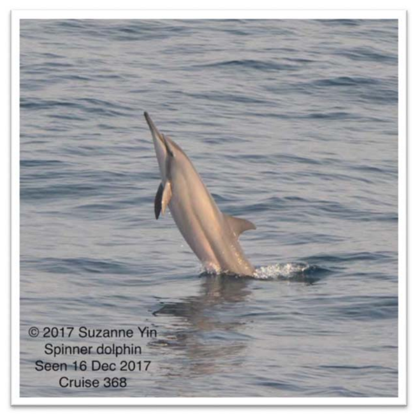
Figure 4. Spinner dolphin seen 16 Dec 2017.