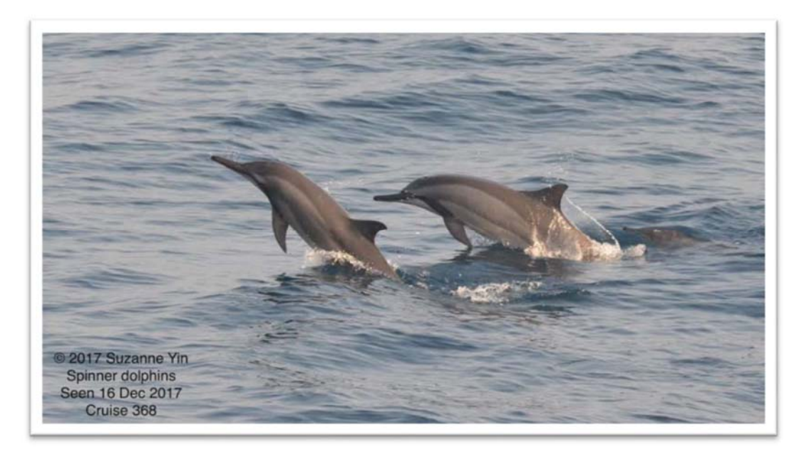
Figure 5. Pair of spinner dolphins seen 16 December 2017.