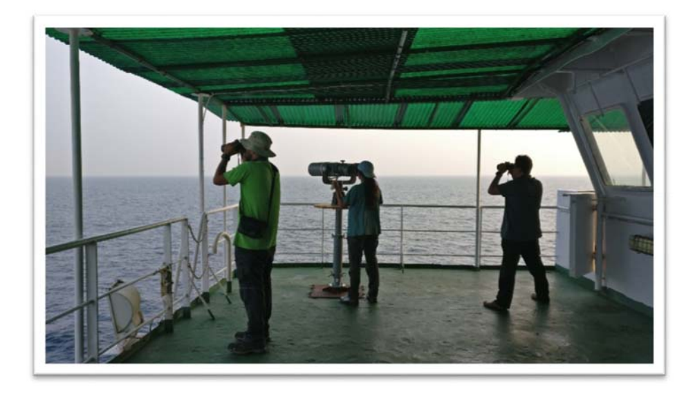
Figure 11. Observers on "Big Eyes" and handheld binoculars.