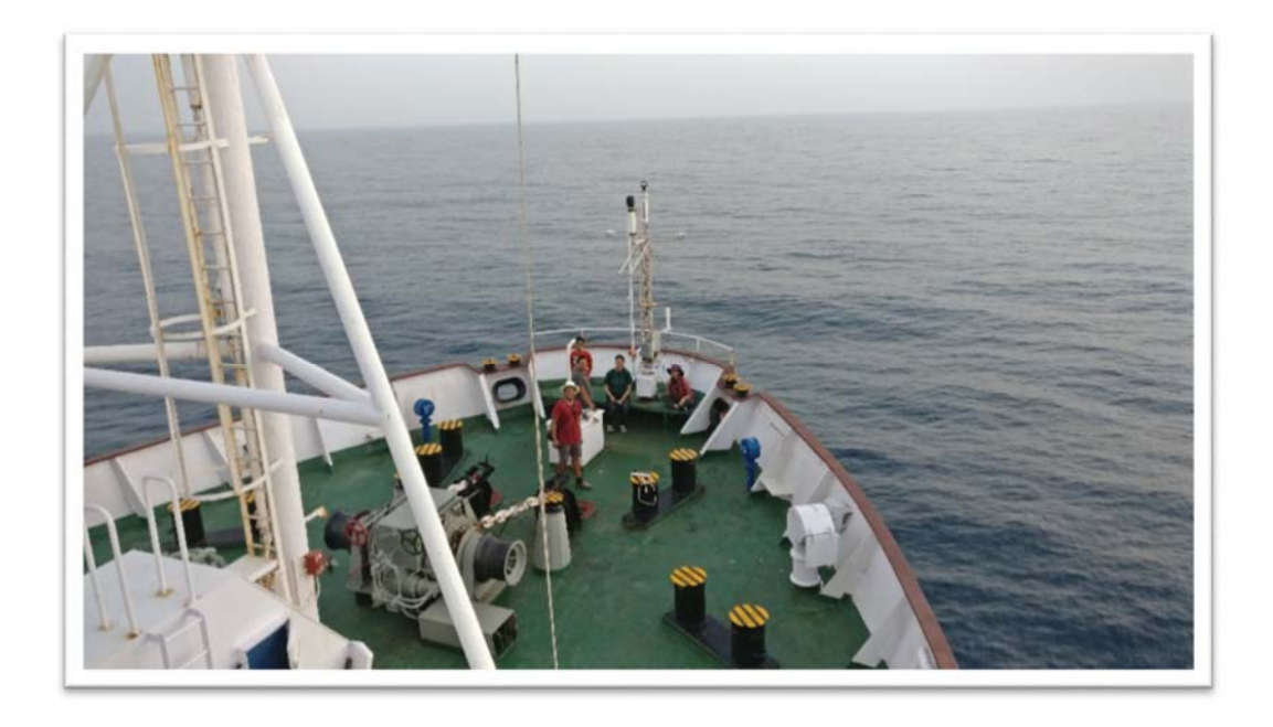
Figure 18. Trainees taking a break after the end of a survey day.