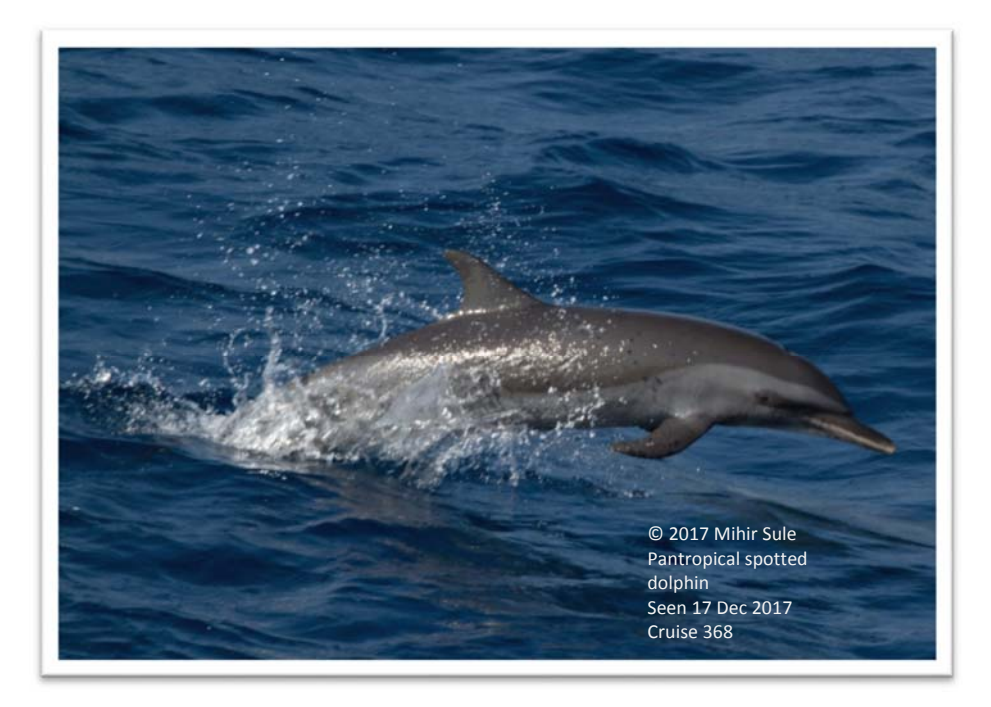
Figure 8. Pantropical spotted dolphin seen 17 December 2017.